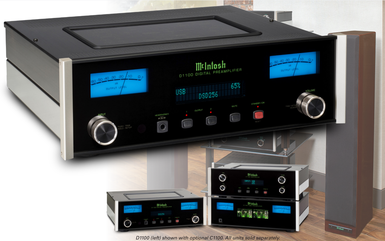
D1100 (left) shown with optional C1100. All units sold separately.